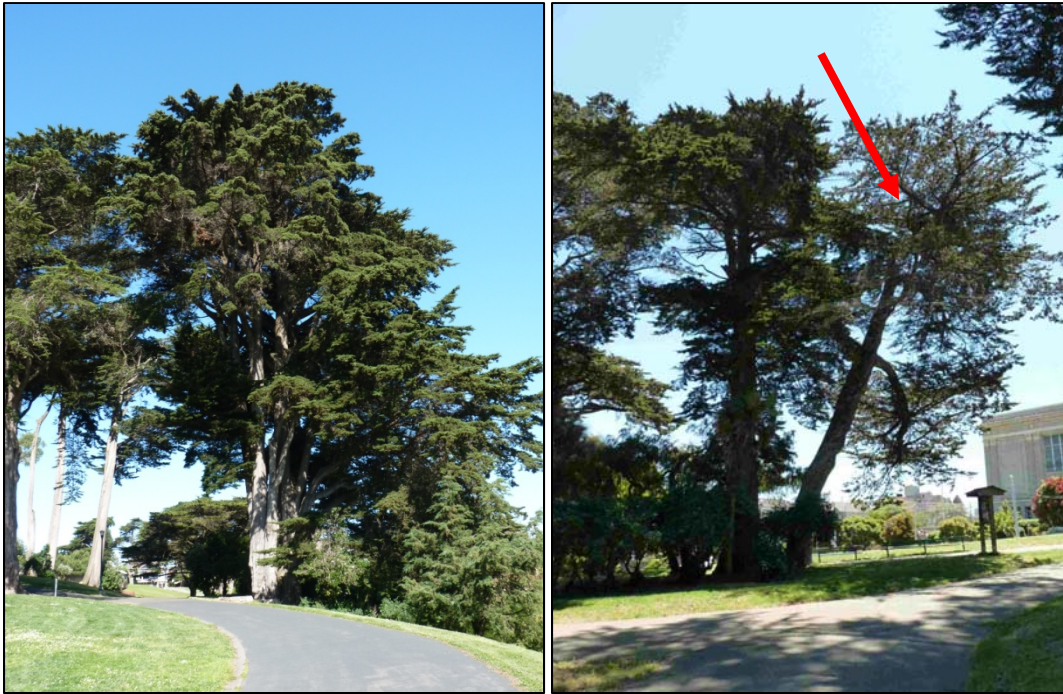
Photo 1. Monterey cypress was represented by trees in good (left photo #37) and poor condition (red arrow, right photo #58).